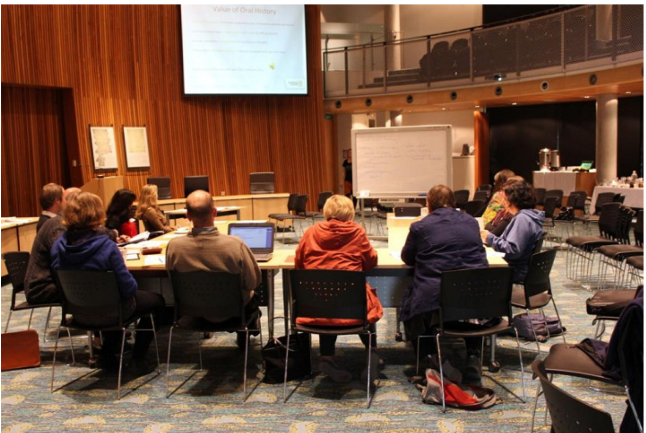
Technical session Day one