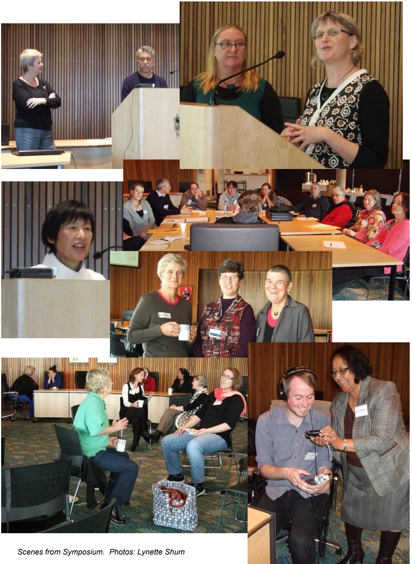
Scenes from Symposium.