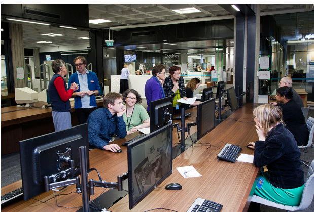
The new Alexander Turnbull Library General reading room