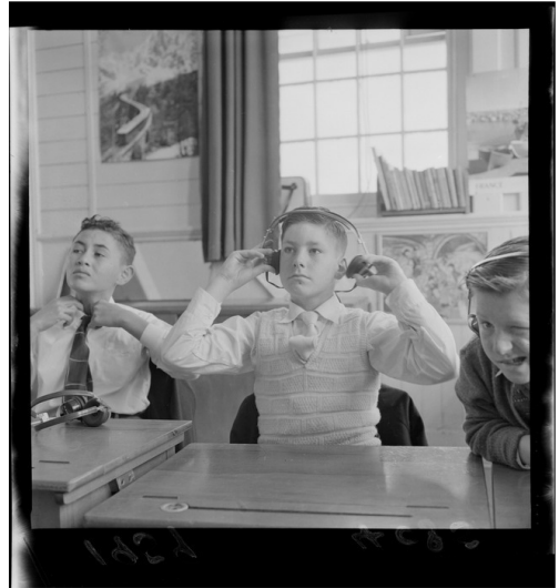
Children listening through headphones at the school for deaf children, Thorndon School, Wellington.