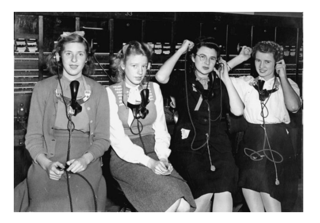
Telephone operators. New Zealand Free Lance: Photographic prints and negatives. Ref: PAColl-5469-047. Alexander Turnbull Library.. http://natlib.govt.nz/records/23075056